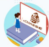
eChinese Magazine 易·华文

Teachers to assign appropriate worksheets for students according to their learning needs 老师会根据各班的需要自行发布电子作业给学生，学生登入时会提醒他有未完成的电子作业。