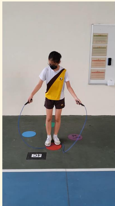
Cross-over (P5 to P6)