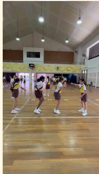
2 Jumpers (P6 only)