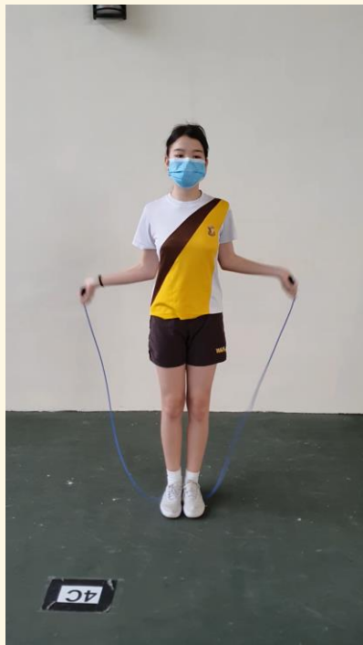
Single Bounce (P1 to P2)