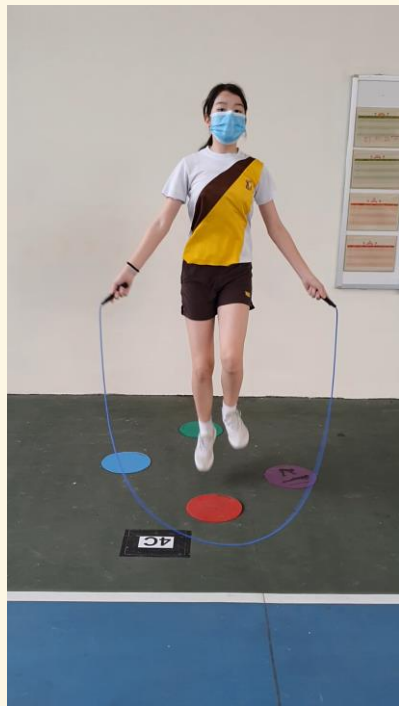
Running Step (P3 to P4)